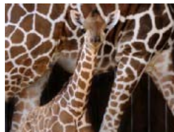
PHOTOS: Disney World Welcomes Baby Giraffe