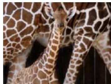
PHOTOS: Disney World Welcomes Baby Giraffe