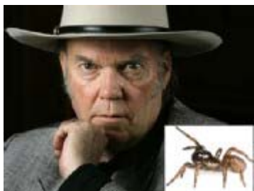
PHOTOS: Spiders & Celebs in Name Game