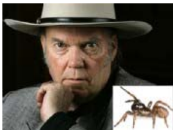
PHOTOS: Spiders & Celebs in Name Game